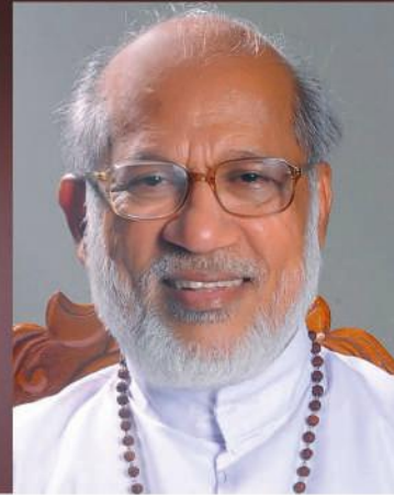
Cardinal George Alencherry Patron