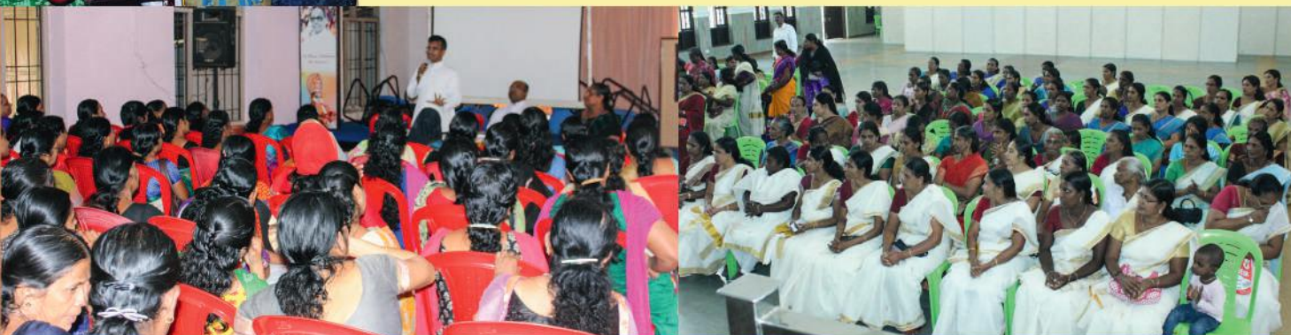
Schemes and Benefits under Social Security Program.